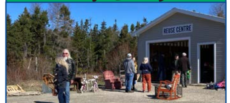
The ReUse Centre is located at the Baddeck Waste Management Facility